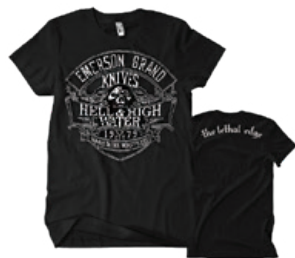
HELL & HIGH WATER