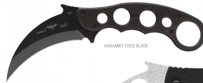
KARAMBIT FIXED BLADE