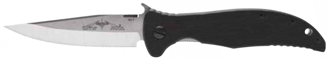
GENTLEMAN JIM SF