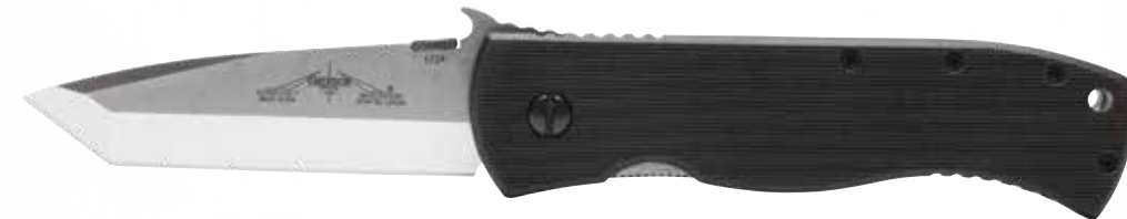
SUPER CQC-7 BW