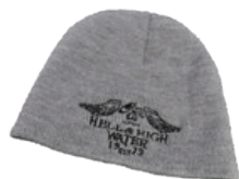
HELL & HIGH WATER BEANIES