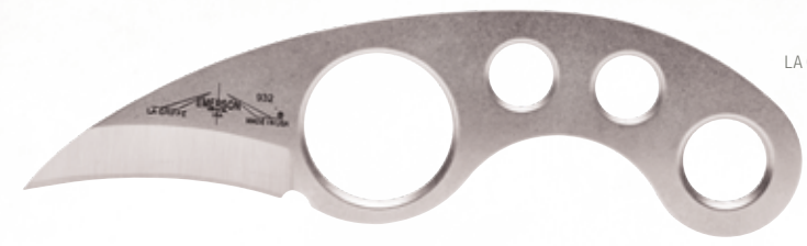
LA GRIFFE BT

GENTLEMAN JIM OVERALL LENGTH: 8.55 IN. BLADE LENGTH: 3.75 IN.