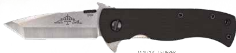
MINI CQC-7 FLIPPER