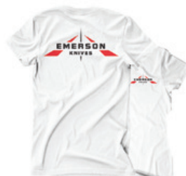
EMERSON LOGO WHITE