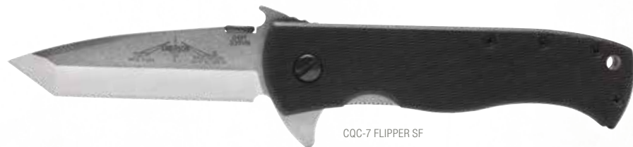
CQC-7 FLIPPER SF