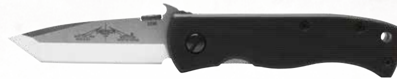
MINI CQC-7 BW