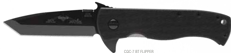
CQC-7 BT FLIPPER